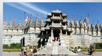
RANAKPUR JAIN TEMPLE