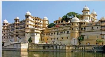
UDAIPUR CITY PALACE

Udaipur city of dawn is a lovely land around the blue water lake hemmed in by the lush hills of Aravallis. A vision in the white drenched and beauty, Udaipur is a fascinating blend of sights, sound and experiences and inspiration for the imagination of poets, painters and writers. It has kaleidoscope of fairy tale of palaces, lakes, temples and gardens. The city carries the flavor of heroic past, epitomizing velour and chivalry. Udaipur was founded in 1553 by Maharana Udai Singh II as the final capital of the erstwhile Mewar Kingdom, located to the south of Nagada on the banks of Banas river.